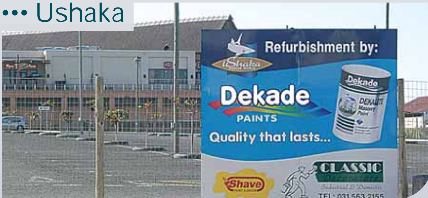
South Africa's premier Theme Park, chose Dekade Dekalite Masonry Paint for its resistance to sea air.